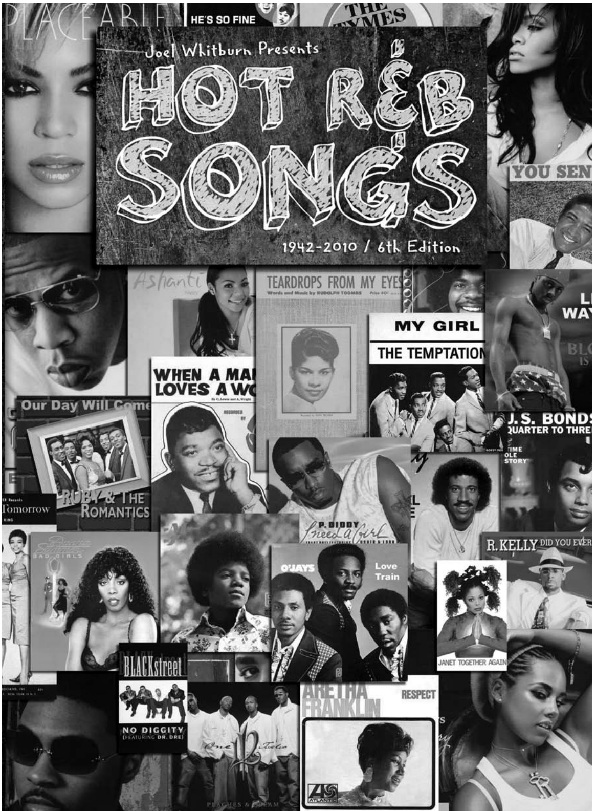
Chart Data Compiled From Billboard's R&B Singles Charts, 1942-2010.